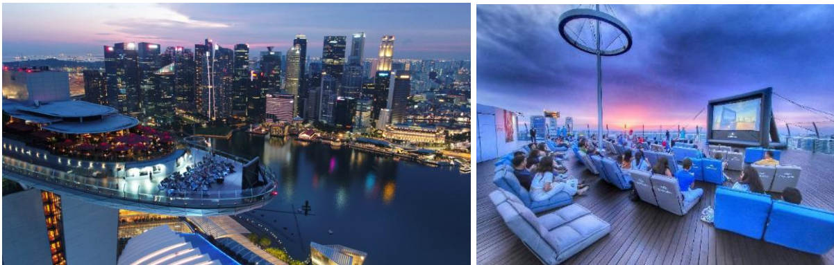
The Sands SkyPark Observation Deck unveils 'Movies in The Sky' on 9 June

Cinewav, Klook and Marina Bay Sands invite guests to 'Movies in the Sky' atop the landmark building