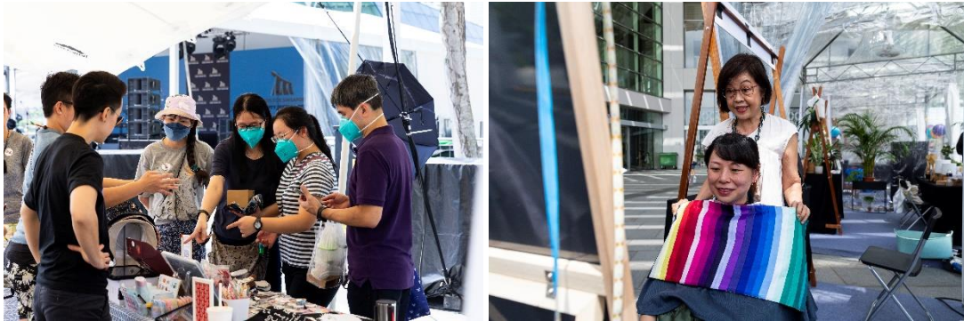
(From L to R): Guests perusing a variety of lifestyle products at the Giving Marketplace, and a guest trying her hand at an Express Colour Check offered by local charity Image Mission.

The Event Plaza was transformed into a bustling Giving Marketplace and featured a curated selection of 15 booths set up by non-profit organisations, social enterprises and small local businesses. Participating community partners raised awareness and funds through the sale of unique items – some handmade by beneficiaries themselves – and gave guests the opportunity to support a cause of their choice. All proceeds were retained by participating non-profit organisations and social enterprises, ensuring that more funds go towards their beneficiaries directly, while small local businesses donated at least 10 per cent of their proceeds towards local charities.