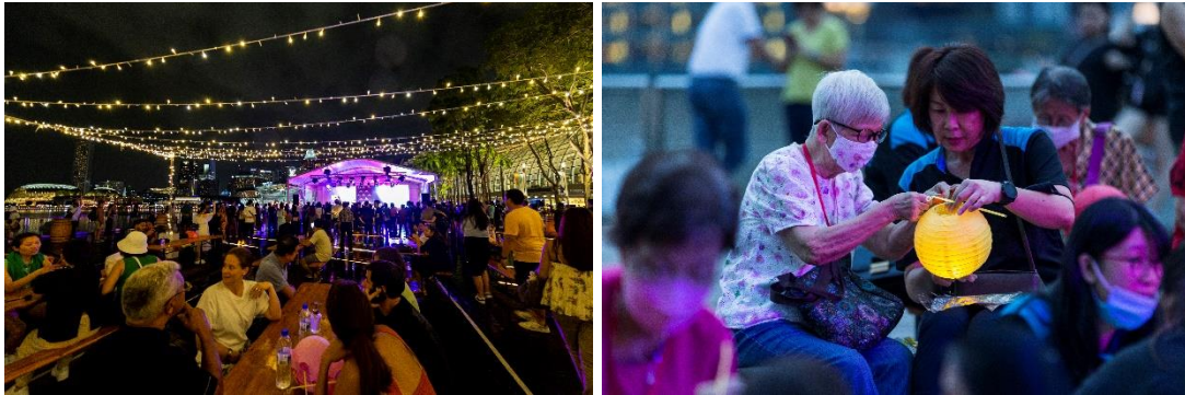
(From L to R): People from all walks of life gathered at Sands for Singapore Charity Festival to enjoy the festivities, including seniors from Care Corner Singapore, who were accompanied by Team Member volunteer befrienders