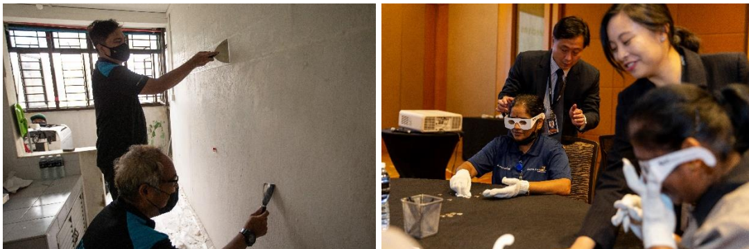
(From L to R): Marina Bay Sands' Team Members volunteered their time to add a fresh coat of paint for AWWA's beneficiaries living in Transitional Shelter units, and learnt more about the challenges that people with disabilities face through a series of simulation exercises with local charity SPD

Beyond the festival grounds, over 1,100 of Marina Bay Sands' Team Members amplified the integrated resort's impact on the community by doing good through a variety of volunteering activities. Team Members stepped up to add a fresh coat of paint for AWWA's beneficiaries living in Transitional Shelter units, relieved food insecurity by assembling and delivering food kits to The Food Bank Singapore's beneficiaries, as well as donated blood to boost Singapore's low blood bank supply with Singapore Red Cross.