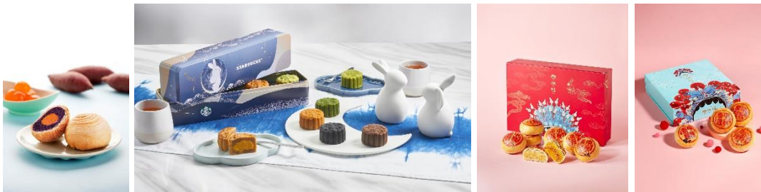
(From L to R): Savour the celebrations with mooncakes from Madam Leng's Handmade Mooncakes by PUTIEN, Starbucks® Mooncakes , BreadTalk's Perfect Harmony set , and Toast Box's Delightful Reunion set

Presented in an elegant, light khaki box adorned with blossoms and swallows, Imperial Treasure's Mid-Autumn delicacies are available for pre-order at estore.imperialtreasure.com or can be purchased in-store. Early bird discounts are applicable up to 15 per cent till 5 September and a S$50 Imperial Treasure dining voucher will be issued for every S$300 spent.