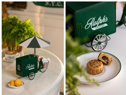
Ralph's Coffee Singapore launches the brand's first ever exclusive mooncake flavours in Singapore