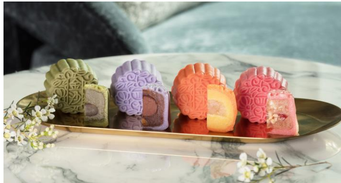
Marina Bay Sands' snowskin gems (from L to R): Matcha Blossom; Ebony; Golden Nest; Strawberry Fields

of Mid-Autumn festival, and enhanced with premium ingredients meticulously sourced from around the world.