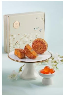
Taste Imperial Treasure's assortment of freshly made quintessential mooncakes

TWG Tea celebrates Mid-Autumn festival with the Grand Miracle Tea Mooncake Collection . Presenting a constellation of flavours encased in a vermillion red Grand Miracle Tea Gift Box, the ethereal pairing of tea and mooncake celebrates the season's celestial spectacle. The artisanal mooncakes are handcrafted to perfection using the purest ingredients as the gift boxes unveil a revolution in the world of tea gastronomy. The Grand Miracle Tea Mooncake Collection will be available from 24 August to 29 September 2023. Each set of two mooncakes paired with Grand Miracle Tea is available at S$98 while a set of four mooncakes is available at S$88.