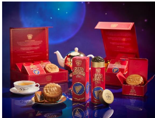
Delight in TWG Tea's Grand Miracle Tea Mooncake Collection

Share in the blessings of Mid-Autumn festival over Ralph's Coffee Lava Mooncakes . For the first time in Singapore, the newly opened Ralph's Coffee has created a unique mooncake box featuring the iconic Ralph's Coffee trike that doubles up as a lovely home décor item. The six handcrafted mini mooncakes feature two exquisite flavours, namely Egg Custard Lava and Coffee Lava , made with the highest quality grown coffee beans from Ralph's Coffee. From now till 30 August, enjoy an early bird discount and purchase a box for S$80.