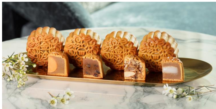
Marina Bay Sands' baked mooncakes (from L to R): Reduced Sugar White Lotus Paste with Single Yolk; Dried Longan Jasmine Tea; Jinhua Ham & Mixed Nuts with Macallan Whisky; Gula Melaka Yam Mochi