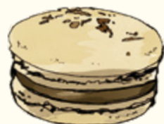
Vanilla Bourbon Tea & Blackcurrant