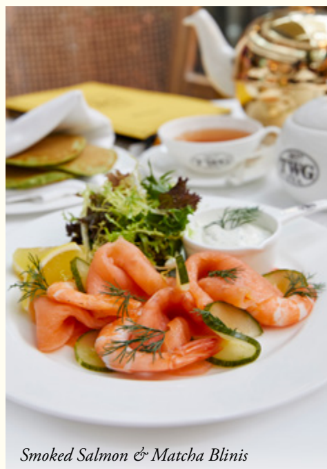
Smoked Salmon & Matcha Blinis