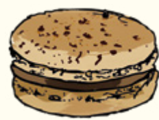
Number 12 Tea & Tiramisu