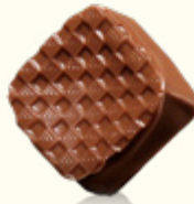
Brothers Club Tea, Maple Syrup & Pecan