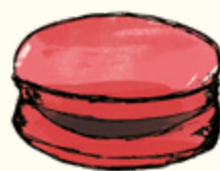
1837 Black Tea & Blackcurrant