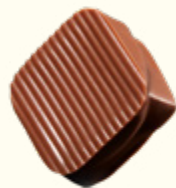
1837 Green Tea, Raspberry & Caramel