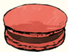
Bain de Roses Tea