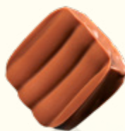
African Ball Tea, Peanut & Salted Caramel