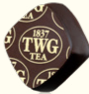
1837 Black Tea, Dark Chocolate Ganache