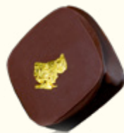
Earl Grey Fortune, Dark Chocolate Ganache