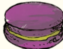
Grand Wedding Tea, Passion Fruit & Coconut