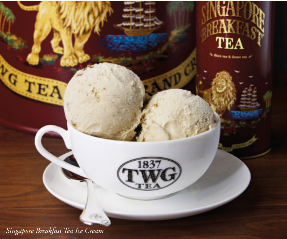
Singapore Breakfast Tea Ice Cream