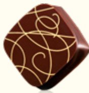
Lemon Bush Tea, White Chocolate Ganache