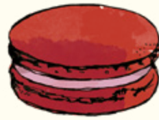
Silver Moon Tea & Strawberry