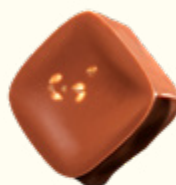
Miraculous Mandarin Tea, Sesame & Honey