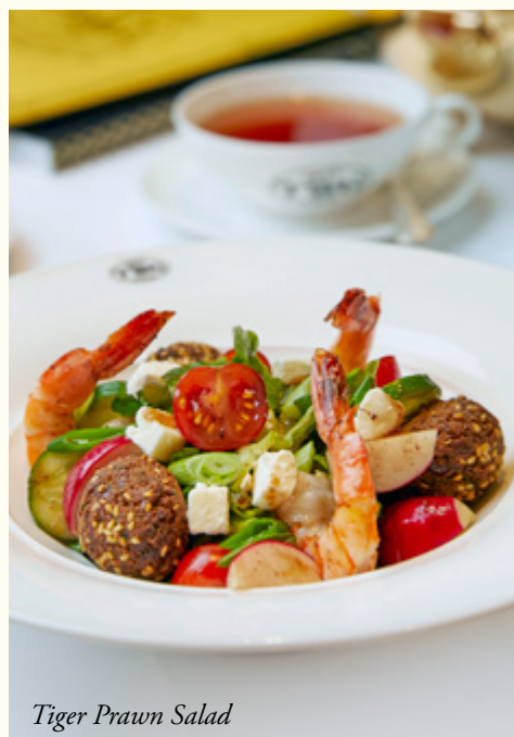
Tiger Prawn Salad