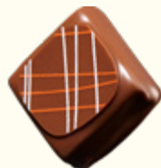
Polo Club Tea, Chestnut & Apricot