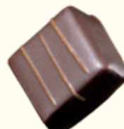
Napoleon Tea & Caramel

Only available at TWG Tea Salons & Boutiques at MBS on the Bay and Takashimaya B2