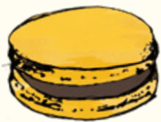
Lemon Bush Tea