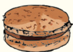
Earl Grey Fortune & Chocolate