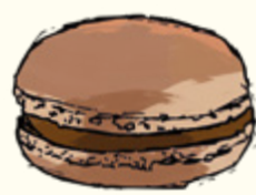
Napoleon Tea & Caramel