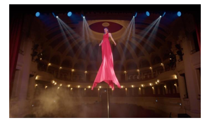
Italian creative agency Hovo Faber will be flying in performers for a special 'Where Art Takes Shape' inspired Dress Show at the Event Plaza

Other must-see installations include Drift (2010) by Antony Gormley, a massive three-dimensional stainless steel polyhedral matrix suspended cloud-like in the air of the atrium of Hotel Tower 1, and Wind Arbor (2011) by Ned Kahn, the largest and most visible piece of the art path as it features 260,000 aluminum metal flappers that reflect light and cools down the building.