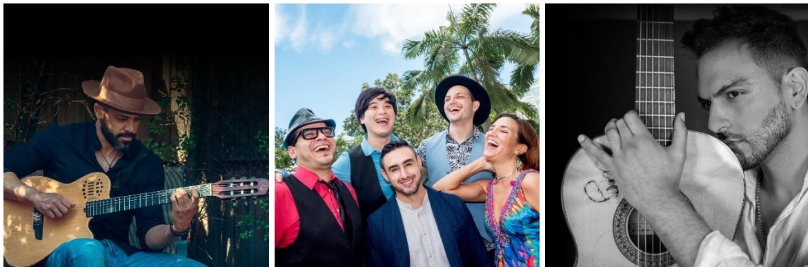
From L-R: Artists performing at Latinfest 2023! on 29 July at Sands Expo & Convention Centre

Over at MARQUEE Singapore, festival-goers can party with American DJ and producer Gryffin , who will be fuelling the crowd with his future bass and feel-good signature hits on 28 July. Gryffin shot to fame for his prowess within the house genre after releasing his debut single “Heading Home” in 2016, and has since played at some of the biggest music festivals worldwide. Joining him will be American rapper and hip-hop icon A$AP Ferg , who will be performing his chart-topping hits and channeling his signature vocal delivery on 21 July. Having proven to be a global sensation who has achieved notable chart success, A$AP Ferg has collaborated with industry heavyweights like French Montana, Snoop Dogg, Nicki Minaj and Tyga.