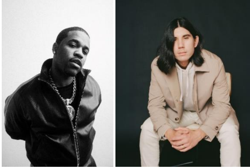
MARQUEE Singapore presents performances by renowned rapper A$AP Ferg and DJ Gryffin

Over at MARQUEE Singapore, festival-goers can party with American DJ and producer Gryffin , who will be fuelling the crowd with his future bass and feel-good signature hits on 28 July. Gryffin shot to fame for his prowess within the house genre after releasing his debut single “Heading Home” in 2016, and has since played at some of the biggest music festivals worldwide. Joining him will be American rapper and hip-hop icon A$AP Ferg , who will be performing his chart-topping hits and channeling his signature vocal delivery on 21 July. Having proven to be a global sensation who has achieved notable chart success, A$AP Ferg has collaborated with industry heavyweights like French Montana, Snoop Dogg, Nicki Minaj and Tyga.