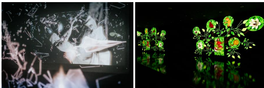
L to R: The Instant was created with a new multilayer projection format that mimics a three-dimensional holographic video; The visual textures and colours in The Dream were developed through an artificial intelligence algorithm that took inspiration from Frida's body of work

At the start of the exhibition is The Altar , a tribute to Kahlo adorned with water, candles, flowers, and items representing her life. It embodies Día de los Muertos – or the Day of the Dead – a Mexican festival where the living celebrate their brief reunion with the souls of deceased loved ones.