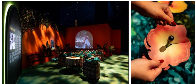
The Garden of Love features a special participation programme where visitors help decorate the floral garden