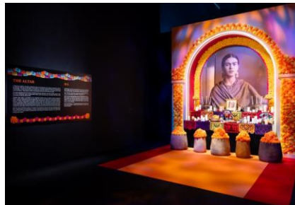
Visitors can pay tribute to Frida Kahlo at The Altar, where her image presides surrounded by a flower arch that represents the gateway between the world of the living and the dead

Produced by Layers of Reality and Frida Kahlo Corporation, the exhibition encompasses eight thematic spaces featuring photographs, films, multi-layered technology, interactive installations, 360-degree projections and interactive spaces that bring Kahlo's story to life. It gives visitors a deeper understanding of Kahlo's creativity and how she lost so much, yet still managed to love and live.