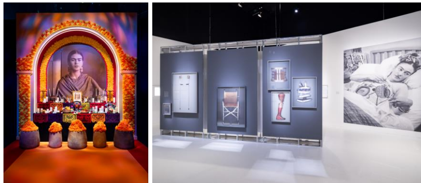
L to R: Entrance to Frida Kahlo: The Life of an Icon; gallery view of Laid Bare: Frida's Inner World

Part of the season Frida Forever , the shows chronicle the artist's incredible life and legacy