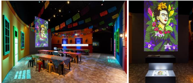
This section of the exhibition is decorated with brightly coloured murals, taking inspiration from a real tavern in Mexico where the walls were painted by Frida's students in her signature colour palette

The artistic motifs that frequently appear in Kahlo's art are explored in the interactive installation, Endless Symbolology . It invites visitors to interact with symbols from Kahlo's paintings including flowers, fruit, a hummingbird, and a monkey, which visually represent themes in her life such as her Mexican culture, her marriage, fertility, pain, and death.