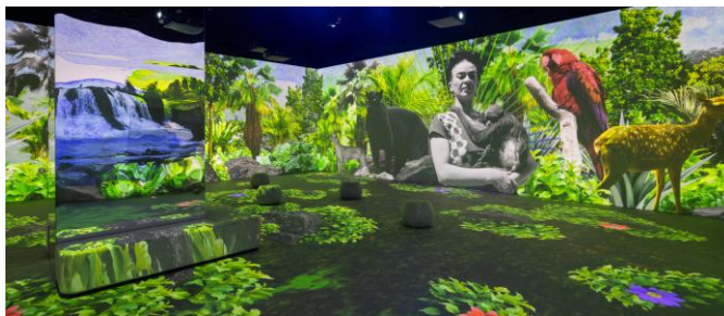
One of the scenes featured in the Immersive Biography space

At the centre of the exhibition is La Rosita , an interactive space that embodies Kahlo's vibrant and exuberant nature. It refers to the tavern, Pulquería La Rosita in Mexico, where Kahlo and her students created murals while she was an art teacher. Within this tavern, visitors of all ages are invited to become artists themselves, personalising their own portraits of Kahlo and projecting them onto the walls of the space.