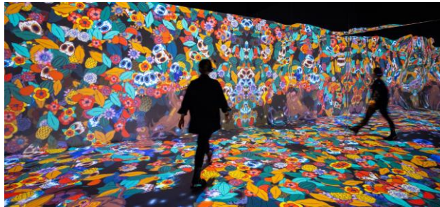
Recognisable symbols often seen in Frida's work include monkeys, skulls, flowers, sharp objects, animals and fruit

The artistic motifs that frequently appear in Kahlo's art are explored in the interactive installation, Endless Symbolology . It invites visitors to interact with symbols from Kahlo's paintings including flowers, fruit, a hummingbird, and a monkey, which visually represent themes in her life such as her Mexican culture, her marriage, fertility, pain, and death.