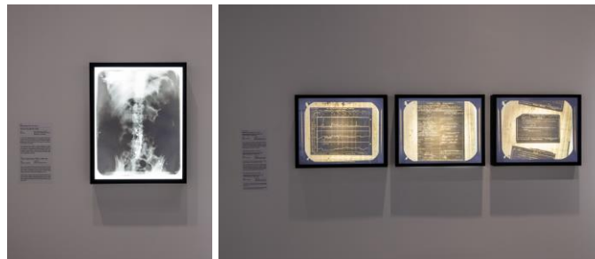
L to R: The x-ray shows where screws and a rod were inserted into Frida's lower back to support her spine; Frida's inpatient vitals chart tracked her body temperature, pulse and breathing rate; this report details her condition before and after the amputation of her lower right leg; pre- and post- operation report documenting her right leg amputation

This exhibition features works from Cristina Kahlo Alcalá's personal collection which are being shown outside of the USA for the first time. They include Frida's medical documents and photographs, an x-ray of the artist's spine taken three months before her passing on 13 July 1954, and clinical datasheets that record her health condition in the lead-up to her last major recorded surgery – the amputation of her lower right leg in 1953 due to gangrene.