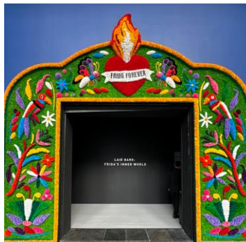
This flower arch is located outside Laid Bare: Frida's Inner World