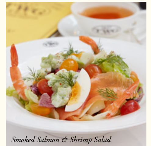
Smoked Salmon & Shrimp Salad