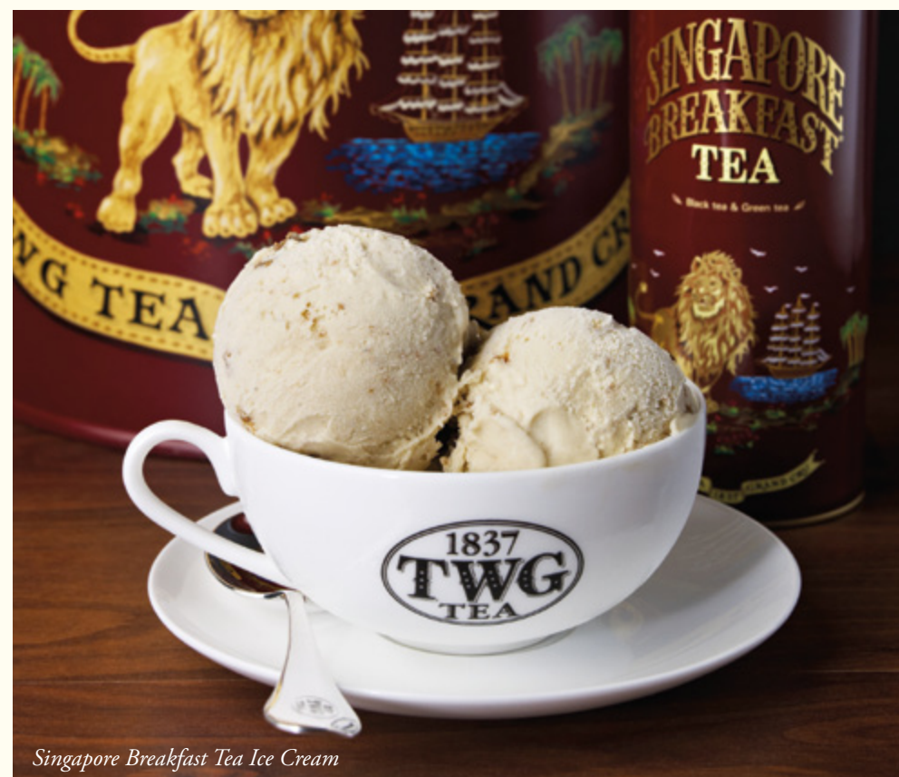
Singapore Breakfast Tea Ice Cream

TWG Prices are not inclusive of service charge or goods & services tax. Minimum order of one teapot per person. PLEASE ASK YOUR WAITER ABOUT ALLERGENS.