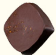
Vanilla Bourbon Tea, Dark Chocolate Apricot