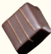
Napoleon Tea & Caramel