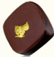
Earl Grey Fortune, Dark Chocolate Ganache