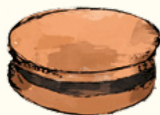
Earl Grey Fortune & Chocolate