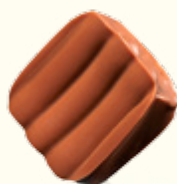
African Ball Tea, Peanut & Salted Caramel