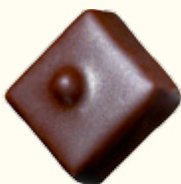
White Night Jasmine Tea, Dark Chocolate Ganache

Only available at TWG Tea Salons & Boutiques at MBS on the Bay and Takashimaya B2