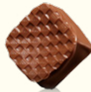
Brothers Club Tea, Maple Syrup & Pecan