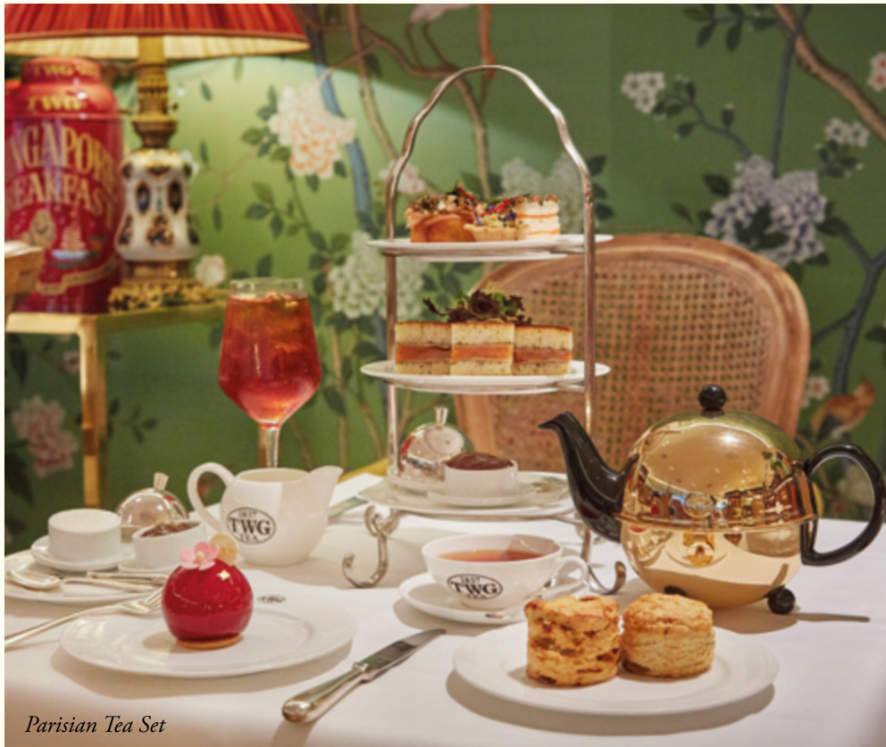
Parisian Tea Set