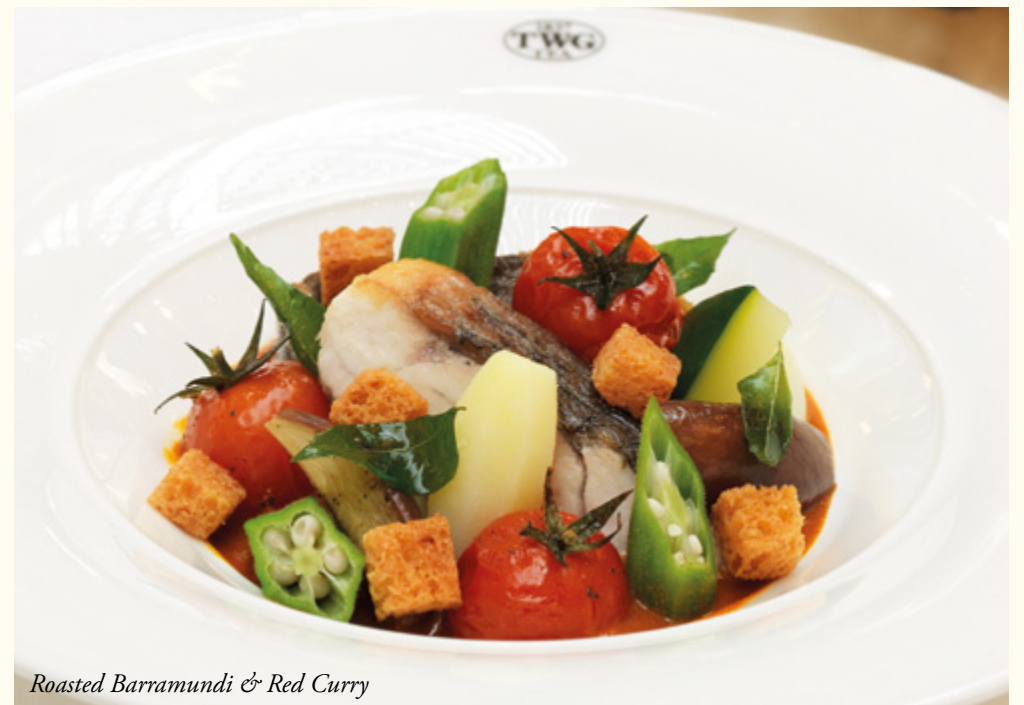
Roasted Barramundi & Red Curry