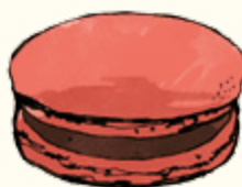
Bain de Roses Tea