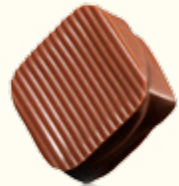
1837 Green Tea, Raspberry & Caramel