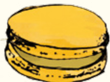
Lemon Bush Tea