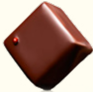
Singapore Breakfast Tea & Hazelnut