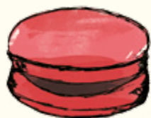
1837 Black Tea & Blackcurrant