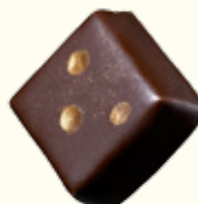
Matcha Nara, White Chocolate Ganache