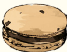
Number 12 Tea & Tiramisu