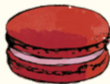
Silver Moon Tea & Strawberry