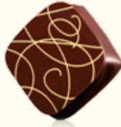
Lemon Bush Tea, White Chocolate Ganache