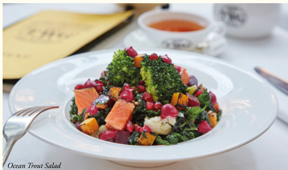
Ocean Trout Salad