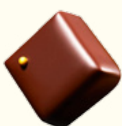
Grand Wedding Tea & Passion Fruit