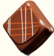
Polo Club Tea, Chestnut & Apricot