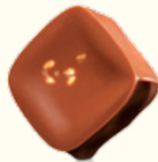
Miraculous Mandarin Tea, Sesame & Honey