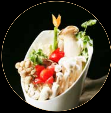
Mushroom Platter 什锦菇拼盘 $14