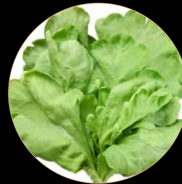
Crown Daisy 茼蒿 $8