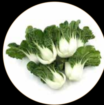
Nai Bai 奶白菜 $8