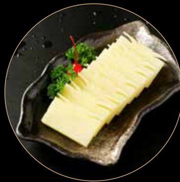
Potato Slices 土豆片 $6