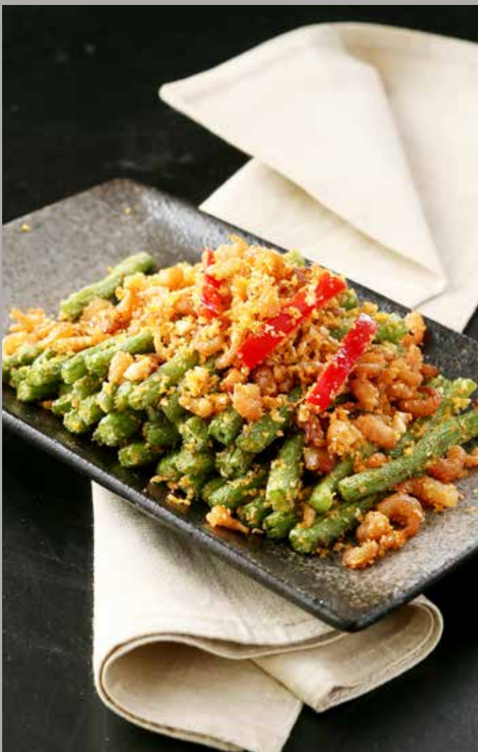
▶ Stir Fried String Beans with Dried Shrimps 虾米四季豆 $15