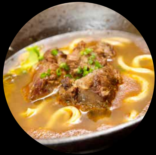
Taiwan Braised Beef Noodles (Dry/Soup) 台湾牛肉面 (干/汤) $18