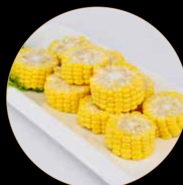
Sweet Corn 甜玉米 $6