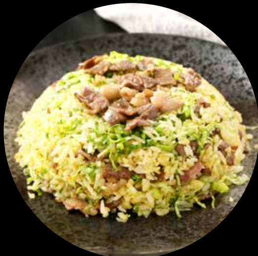
Fried Beef Rice 生炒牛肉饭 $38