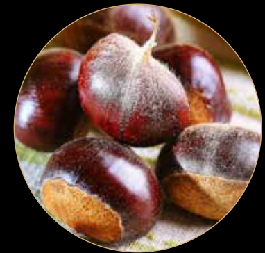
Chestnut 黄金板栗子 $8