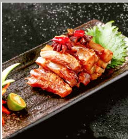
Beef Tendon 秘制牛蹄筋 $18