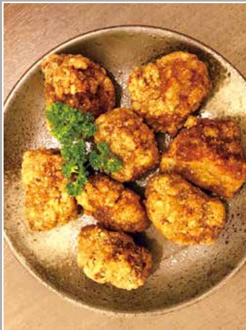
Fried Spare Ribs 招牌排骨酥 $18