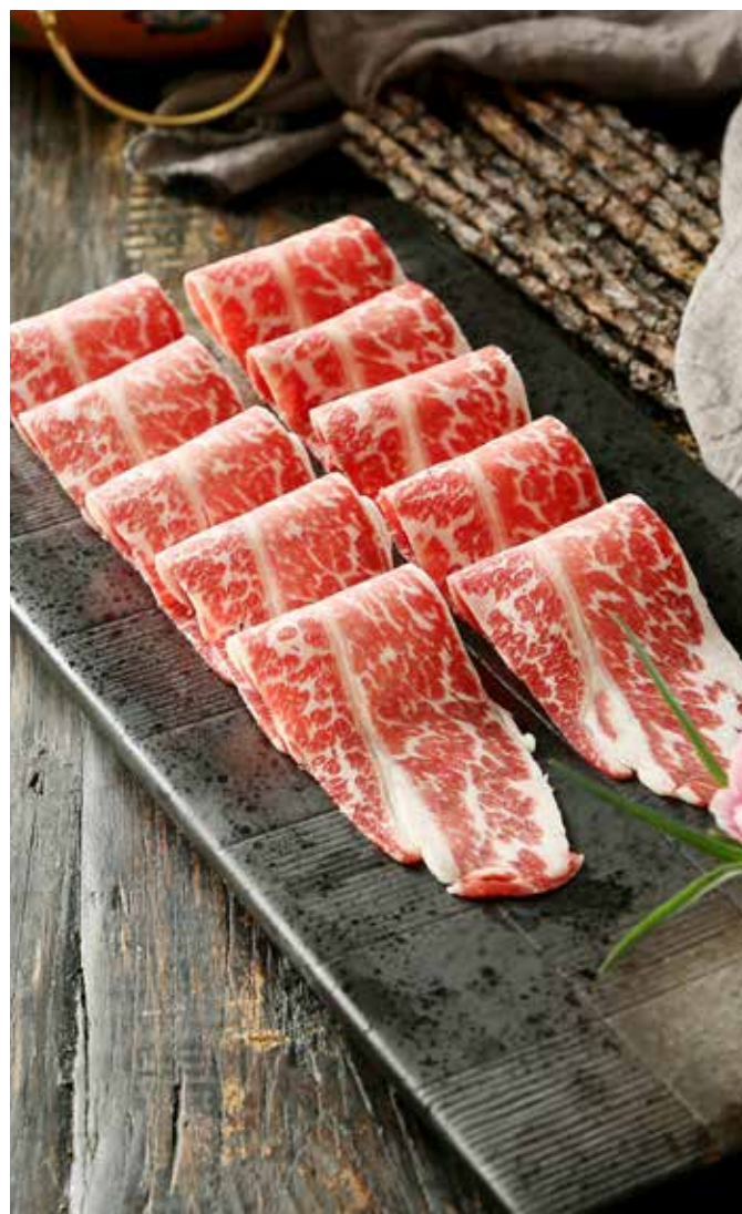
Japanese Pork Collar 日本猪梅花肉 $22