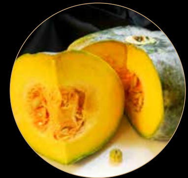
Pumpkin Slices 南瓜片 $8