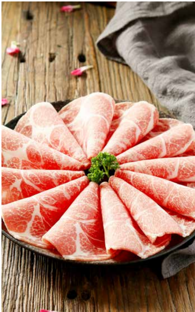
Snowflakes Wagyu Beef 精品雪花肥牛 $48