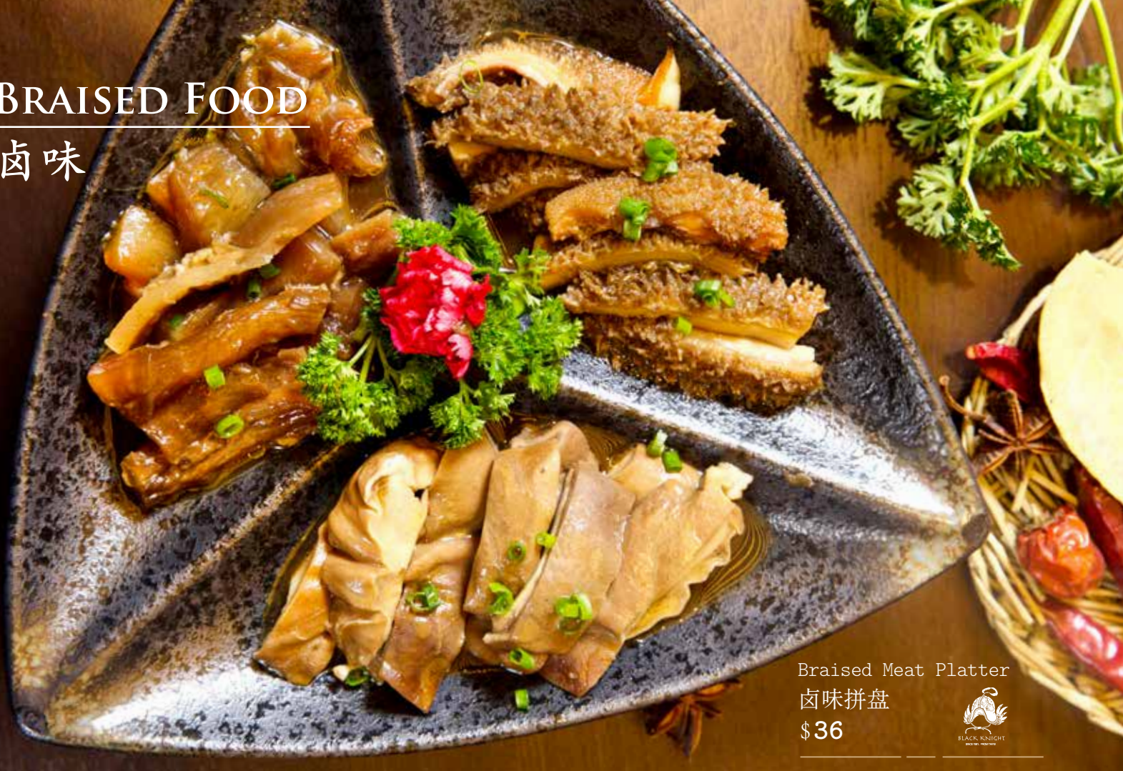
Braised Meat Platter 卤味拼盘 $36