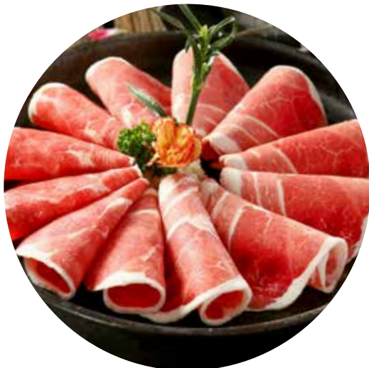
Aus. Lamb fillet 澳洲羊腿肉 $28