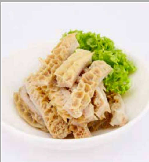
Pork Tripe 秘制猪肚 $18