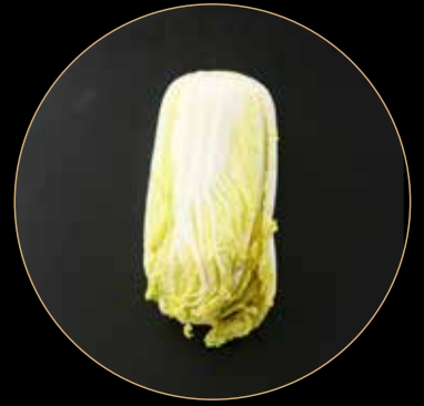
Cabbage 白菜 $8