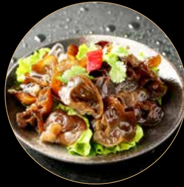
Organic Black Fungus 有机黑木耳 $8