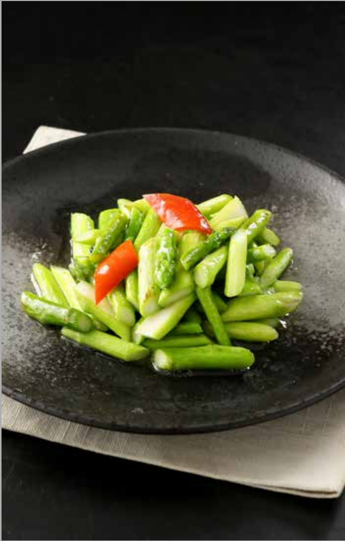
▶ Sautéed Seasonal Vegetable with Garlic 蒜蓉炒时蔬 $16