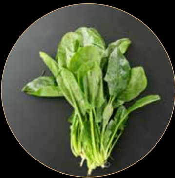
Spinach 菠菜 $8