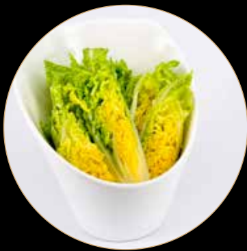
Baby Cabbage 娃娃菜 $8