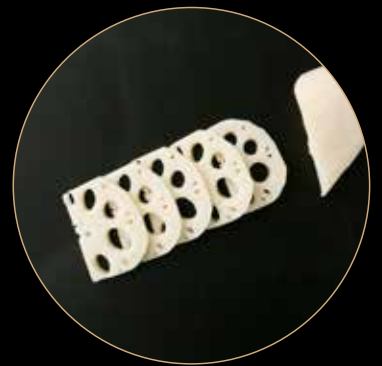
Lotus Root Slices 莲藕片 $8