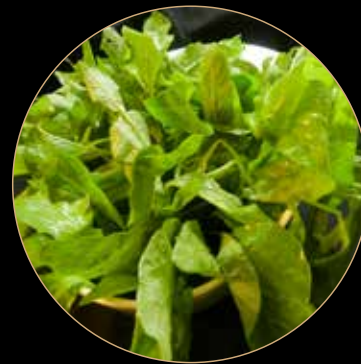
Chinese Spinach 苋菜 $8