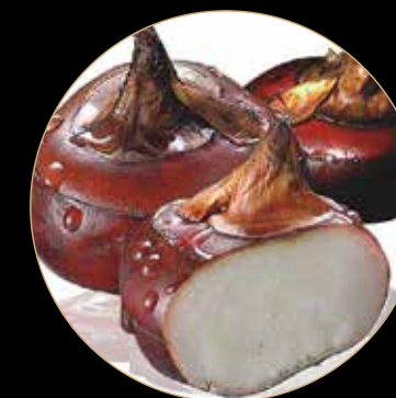
Water Chestnut 马蹄 $8