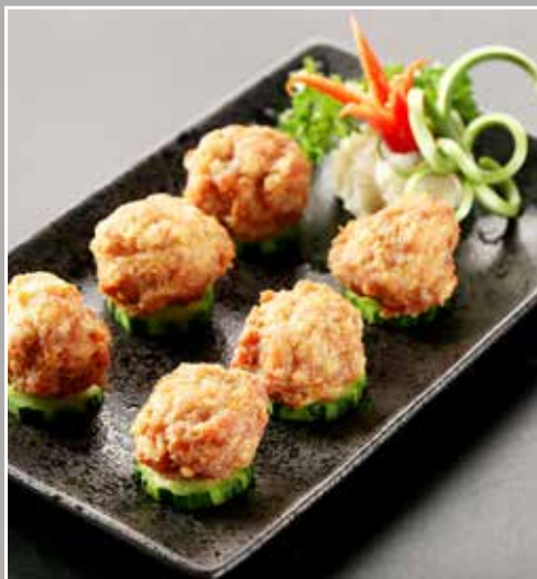
Fried Meat Balls 招牌川丸子 $15