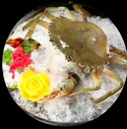
Sri Lanka Crab