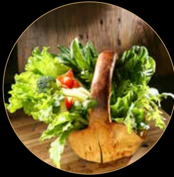
Vegetable Platter 蔬菜拼盘 $14