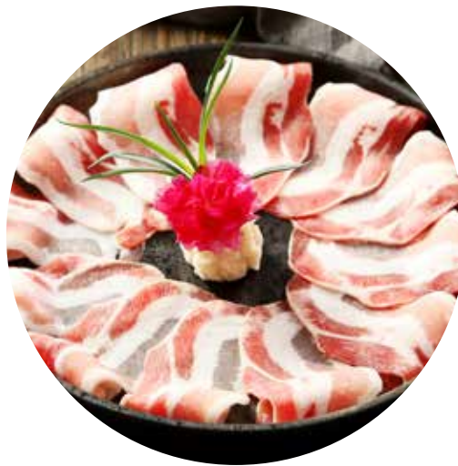
Okinawa Black Pork Belly 冲绳岛黑猪五花肉 $28