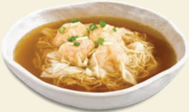
19. Hong Kong Wonton Soup Noodle 港式云吞汤面 $8.00