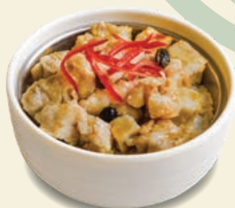
17. Rice with Pork Spare Ribs, Yam & Black Bean 喷香排骨芋头饭 $7.50