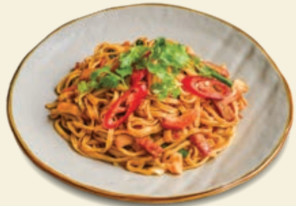
20. Spicy BBQ Pork Stew Noodle 香辣叉烧焖伊面 $7.00