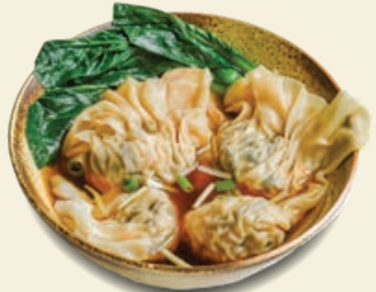
22. Shrimp, Bamboo Shoot and Black Fungus Dumpling Soup 鲜虾水饺汤 (4pcs) $7.00