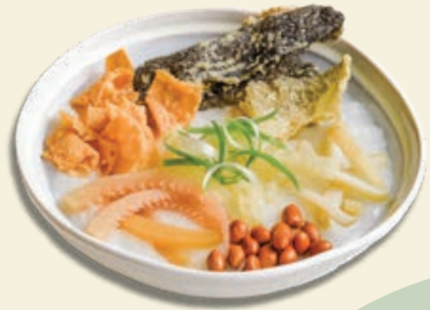
13. Special Hong Kong Congee (Contain Peanuts) 港式艇仔粥 $7.00