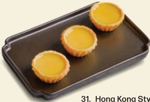
31. Hong Kong Style Egg Tarts 黄金蛋挞 🌿 (3pcs) $5.00