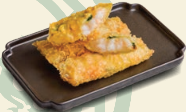
27. Fried Beancurd Skin with Shrimp 鲜虾腐皮卷 (3pcs) $7.00