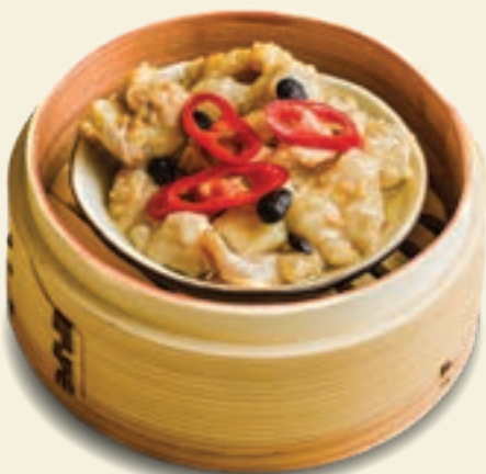
6. Pork Rib with Yam & Black Bean 豉汁蒸肉排芋头 $6.00