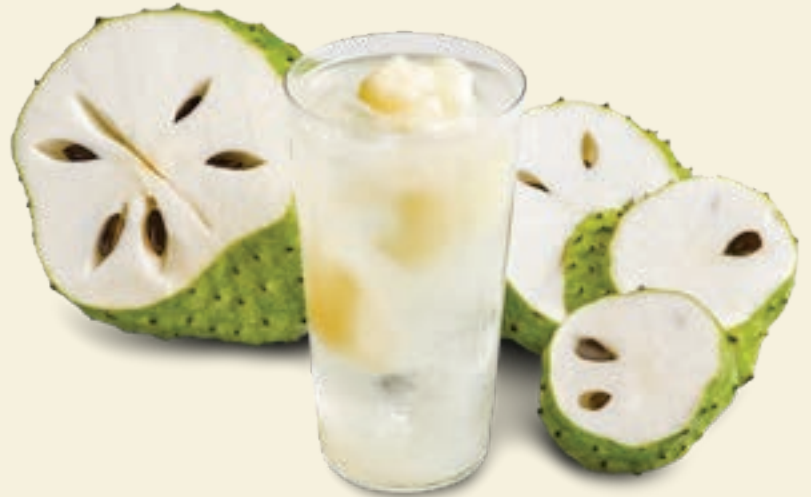
38. Soursop Juice 酸甜番荔枝 $4.00