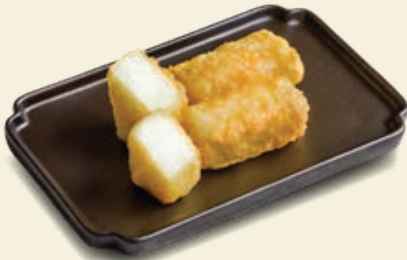
35. Deep Fried Milk Custard 脆皮鲜奶卷 🌿 (3pcs) $5.00