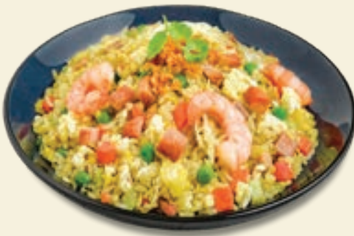
14. Yangzhou Fried Rice 扬州炒饭 $9.50