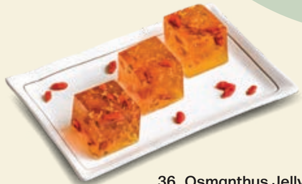
36. Osmanthus Jelly 杞子桂花糕 🌿 (3pcs) $4.00