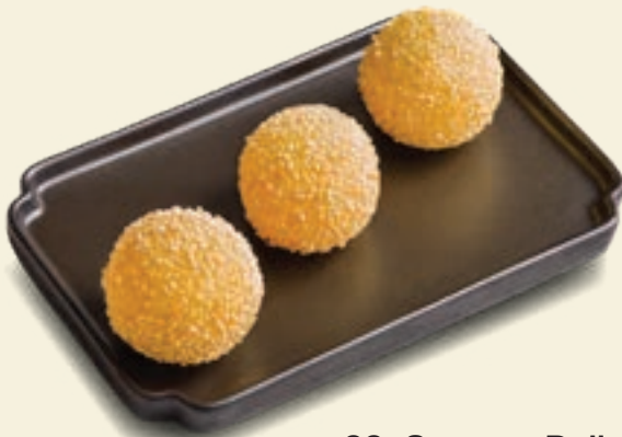
33. Sesame Balls with Molten Salted Egg 流沙煎堆 🌿 (3pcs) $5.00