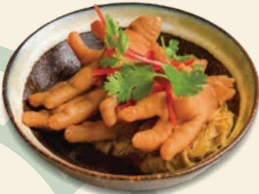
21. Braised Phoenix Claw in Abalone Sauce 鲍汁焖凤爪 $6.00