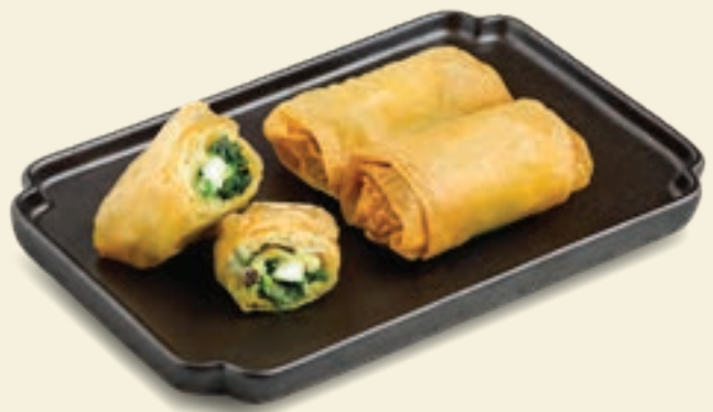
30. Shrimp with Chives in Filo Pastry 韭菜鲜虾酥皮卷 (3pcs) $6.00