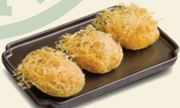
29. Taro with Chicken Dumplings 家乡炸芋角 (3pcs) $6.00