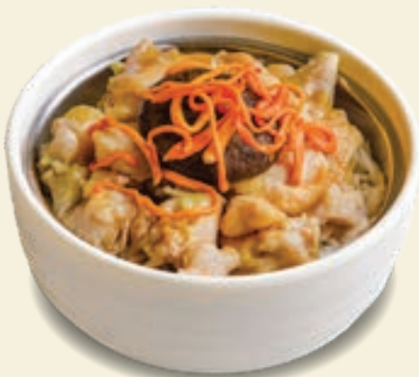
16. Rice with Chicken, Cordyceps Flower & Mushroom 虫草花北菇鸡饭 $7.50