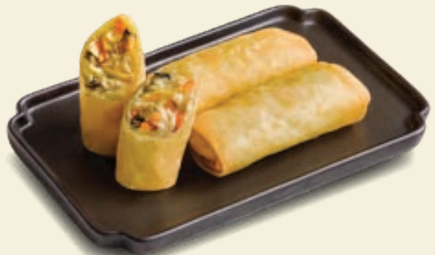
28. Shredded Chicken Spring Roll 鸡丝炸春卷 (3pcs) $6.00