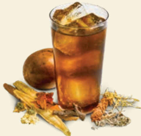
40. Herbal Flower Tea 清凉五花茶 $3.00