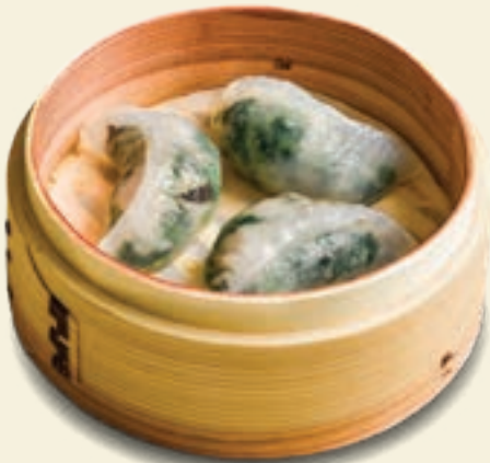
4. Spinach Dumplings with Shrimp 鲜虾菠菜饺 (3pcs) $5.50