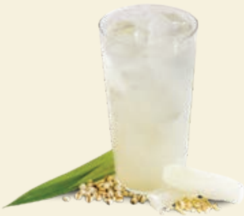
39. Barley with Winter Melon 冬瓜薏米水 $3.00