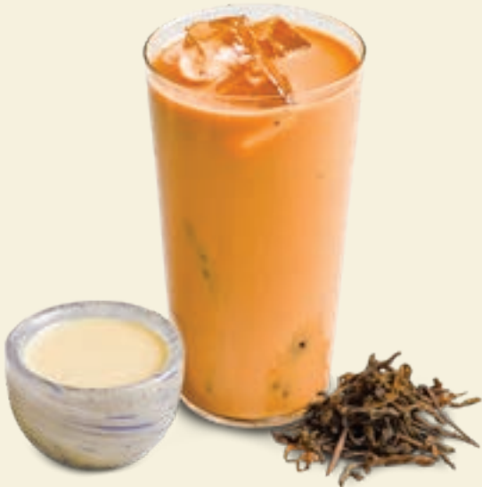
37. Hong Kong Style Milk Tea 港式奶茶 $4.00