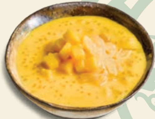
34. Mango Sago 香芒西米露 🌿 $5.50