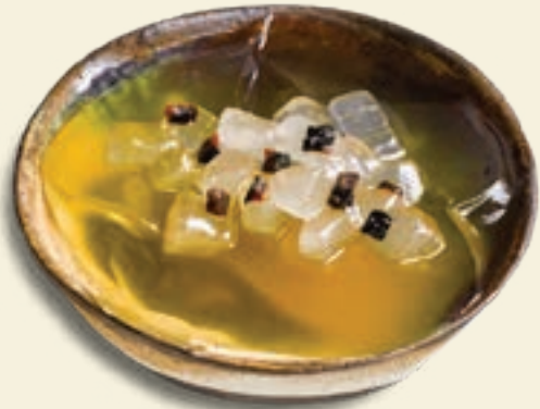
32. Chrysanthemum Aloe Vera Jelly 菊花芦荟冻 🌿 $5.00