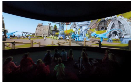
The Dragon Flight, a 40-foot diameter, 180-degree panoramic screen

Fans will be provided with interactive opportunities throughout the exhibition that unveil the secrets of creative filmmaking and animation. Visitors of all ages can learn the basic principles of animation while creating their own short movie at The Animation Desk, using a simplified version of DreamWorks' software.