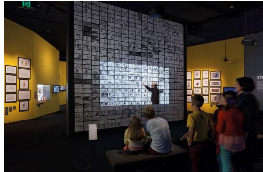
Digital storyboard that shows Conrad Vernon pitching for Shrek's infamous 'Interrogating Gingy' scene

A massive digital storyboard anchors the Story gallery. Visitors will be drawn in as they watch filmmaker Conrad Vernon perform, step-by-step, his gripping pitch for the infamous 'Interrogating Gingy' scene in Shrek .