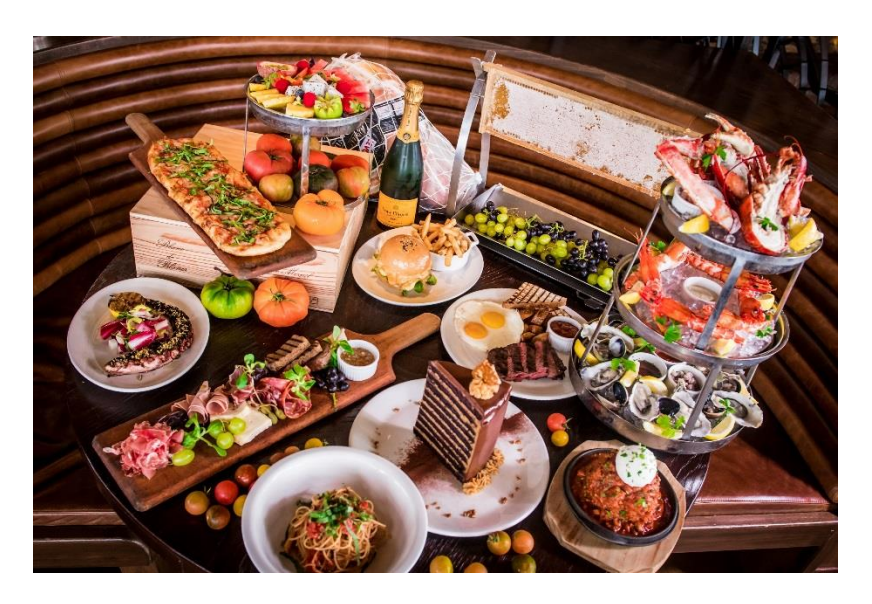
Pamper your dad with a celebratory champagne brunch at LAVO

On 16 June, Rise restaurant at Marina Bay Sands will also elevate its international buffet spread with special live stations serving the premium sanchoku wagyu , as well as Chinese delicacies such as teochew style steamed fish and braised sea cucumber with beancurd and broccoli . Guests can opt for Rise's free-flow beverage package ($$38++) to pair the feast with beer and selected wines. All fathers will also receive a complimentary canister of tea. Lunch buffet is priced at $$78++ per adult and $$25++ per child, while dinner buffet is priced at $$88++ per adult and $$38++ per child. For reservations, email Rise@MarinaBaySands.com or call +65 6688 5525.