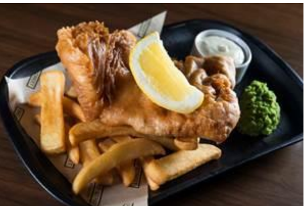
Bread Street Kitchen by Gordon Ramsay will present special renditions of its signature dishes this June (from L to R): beef filet wellington and fish & chips

Join the Gordon Ramsay restaurants worldwide in celebrating Wellington Month at Bread Street Kitchen in Marina Bay Sands. For the whole month of June, the restaurant will be taking the wellington game up a notch with two limited-time specials: the lobster and saffron risotto wellington ($$65++) and the lamb wellington with minted red wine jus, green peas, baby bock choy and sundried tomatoes ($$59++). Diners can also savour Bread Street Kitchen's signature beef filet wellington ($$80++) – a classic assembly of juicy seared filet mignon, salty prosciutto, herb crepe, and savoury mushroom duxelles encased in a golden crisp pastry crust, as well as the plant-based Impossible wellington ($$39++).