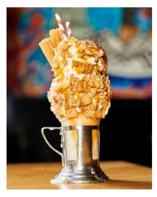
Fans of cinnamon spice will delight in Black Tap's new churros choco taco shake

This June, Black Tap Craft Burgers & Beer welcomes the churros choco taco shake (S$22++) to its line-up of gravity-defying CrazyShakes. Making its debut on the permanent CrazyShake menu worldwide, the churros choco taco shake sits in a tall glass drizzled with caramelized