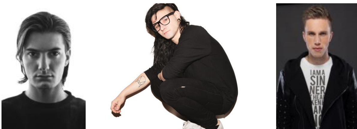
(L-R): Image of Swedish DJ Alesso, American DJ Skrillex and Dutch DJ Nicky Romero who are performing at Road to Ultra Singapore 2015

Top-ranking international DJs and music celebrities to perform at Marina Bay Sands during F1 week